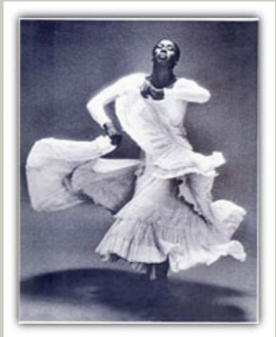
Judith Jamison dancing in Cry, 1976.

No one who ever saw Judith Jamison in performance can forget the tall, lithe figure, with arms seemingly extending into outer space, who brought significant recognition to dance as performed by African Americans. As a dancer for the globally acclaimed Alvin Ailey American Dance Theater from 1965 to 1980, Jamison performed landmark pieces -- such as the anguished Cry and the exultant Revelations -- that invariably brought audiences to their feet. Her years on stage with the Ailey company laid the foundation for her second career; since 1989, she has been a choreographer and artistic director for the Alvin Ailey American Dance Theater in New York City.