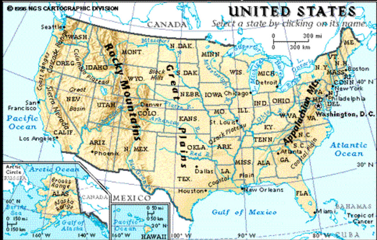
Developed in association with GeoSystems Global Corp.

Click on a state name to see a detailed map and information.